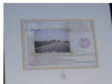
The last passenger train to run on the line was May 1954